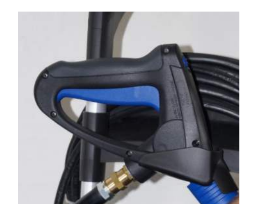
Unique patented Spray Gun Holder protects the gun from falling on the ground and being dragged behind the machine – preventing damage.

Designed for low intensity cleaning applications, the MC 4M is the powerful choice for small and medium agricultural sites, building companies, garages and car rental companies. Also, well suited to meet the needs of public authorities, small cleaning companies due to the limited sound level of the motor pump.