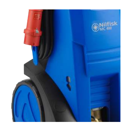
The turnable cable hook makes winding and unwinding of the electrical cable child's play.