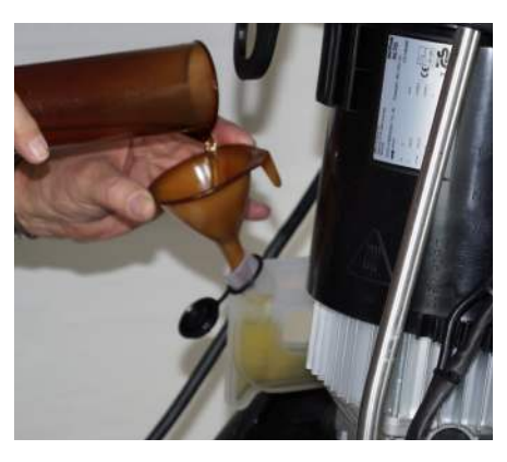
Pump oil tank with oil level sight and fill/empty function.

Some machines in the MC 4M range include this FoamSprayer technology, which allows a simple and efficient application of detergent. If not included it can be bought as an optional accessory.