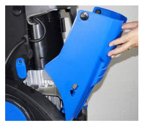
Cabinet can be removed quickly for direct access to the motor pump.