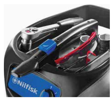
Improved accessory storage, tool deposit and container volume.