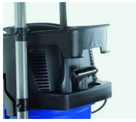
The design lets you have your accessories on hand in a secure way.