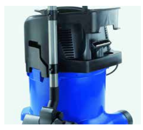
Tube storage, with hook and clip secures a good fit to the machine.