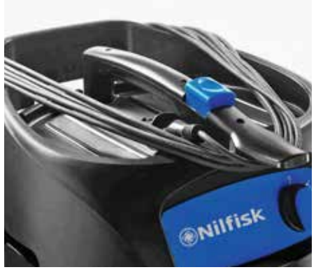
The ergonomic and sturdy grip allows one hand cable rewinding and cable storage.