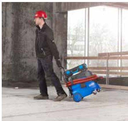
Robust and easy to handle. Convenient transport and flexible storage solution.