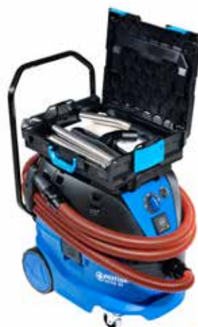
Optional storage box for accessories, extra filter and/or dust bags.