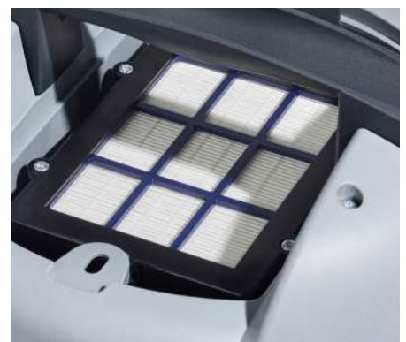
High filtration level with HEPA exhaust filter