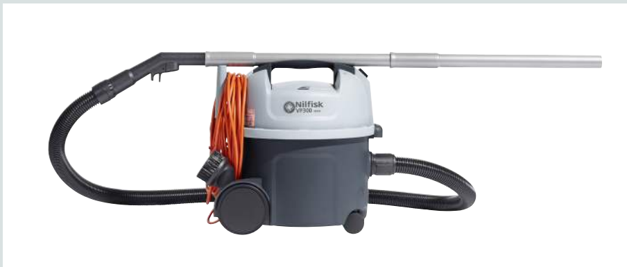
VP300 can be carried safely and comfortably in one hand