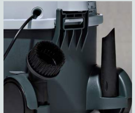
Discreet storage for nozzles allow all the tools you need to be within easy reach at all times