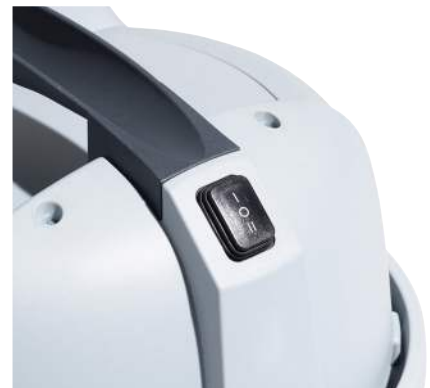
Dual speed for tailored use in a wider variety of applications