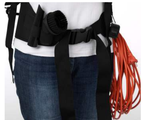
Accessories are stored on the belt for easy access