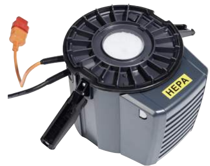
Easy to install HEPA exhaust filter as standard