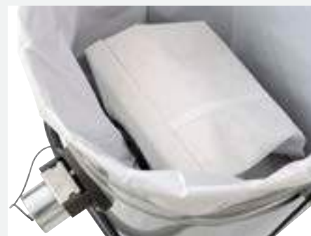
Safe bag for toxic material