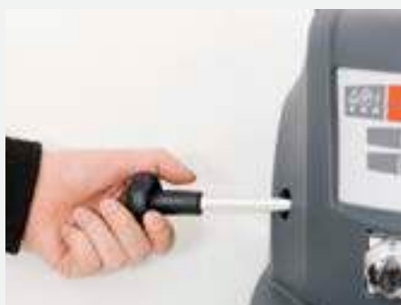
Manual filter shaker