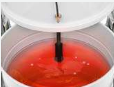
Liquid cut-off system