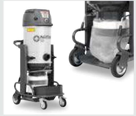
S3 with gravity unload system with Longopac®