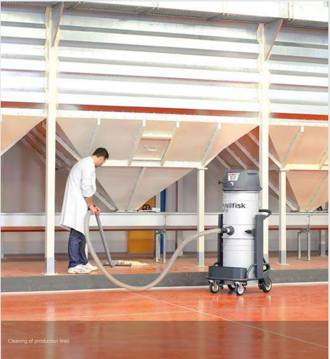
Cleaning of production lines