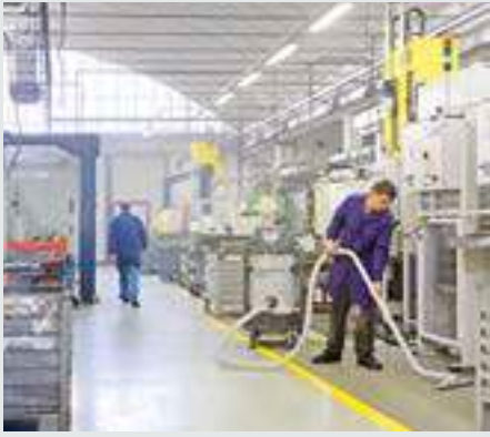
Cleaning of a metal company