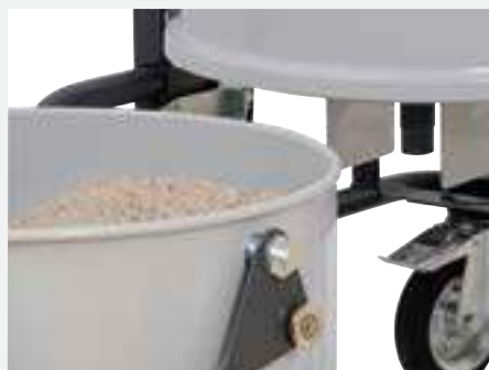
Solid cut-off system