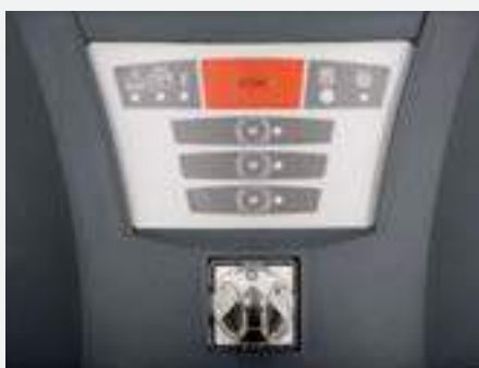
Electronic board control