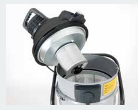
Star filter and absolute filter