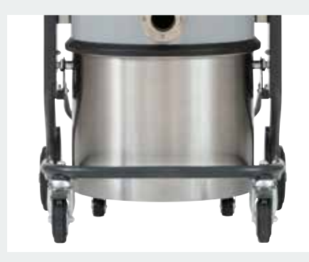
Stainless steel 37L container