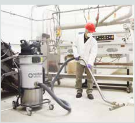
Cleaning of the production area to secure the Practical container release system highest level of hygiene