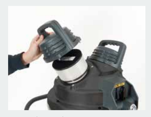
Absolute filtration for the cooling air