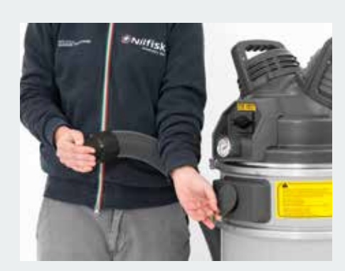
PullClean filter cleaning system: close the inlet and pull the flap rapidly and several times