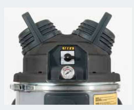
Vacuometer to monitor constantly the vacuum cleaner performances