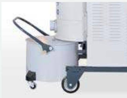
Container release system