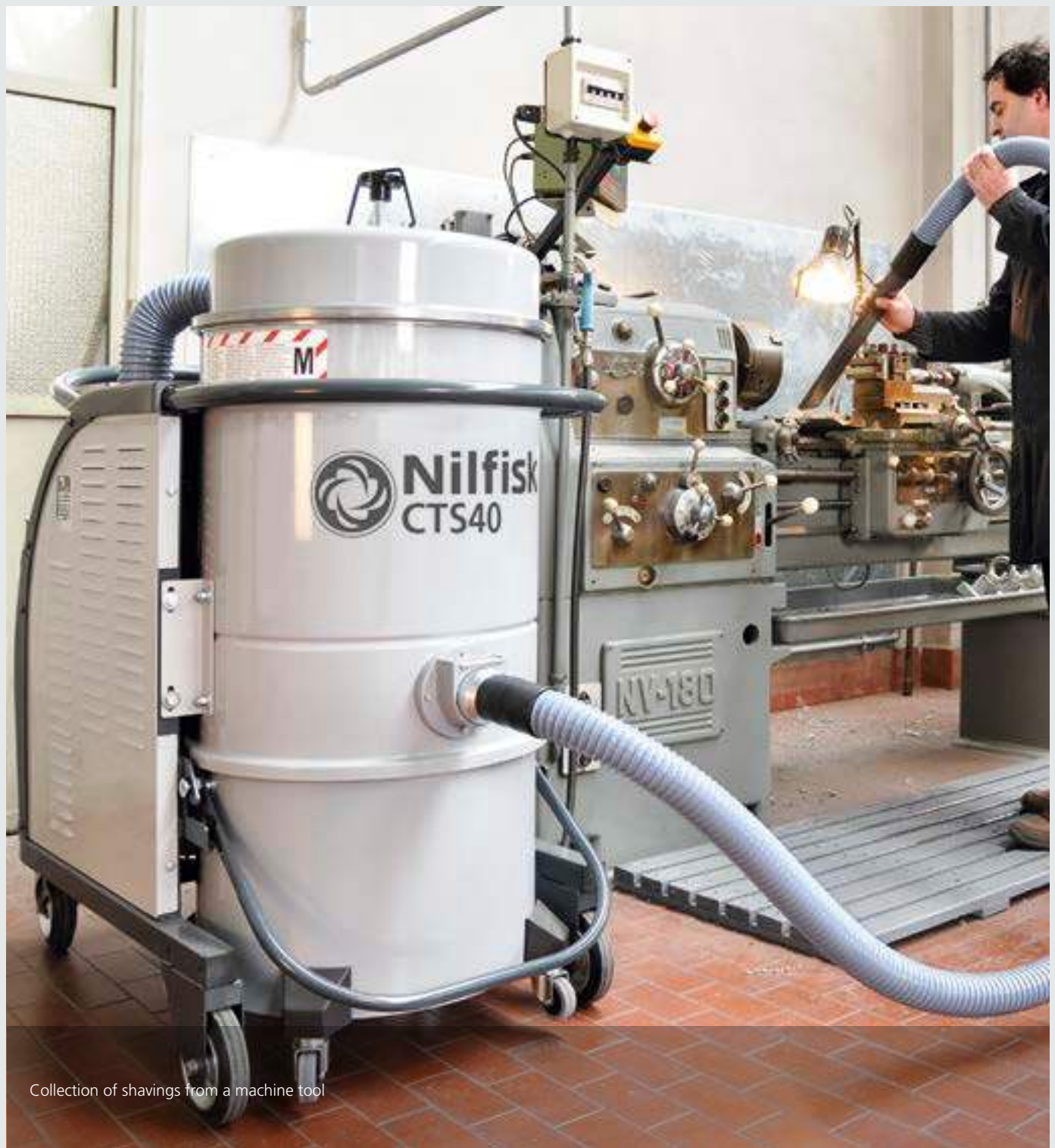
Collection of shavings from a machine tool