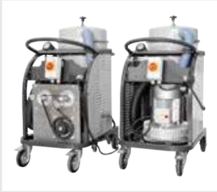
Turbine or lateral channel vacuum unit