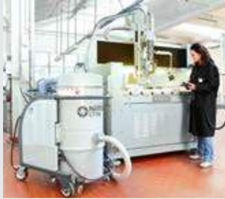
Recovery of shavings from marble carving