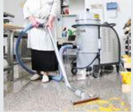
Collection of pasta, flour and sugar