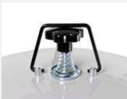
Manual filter shaker