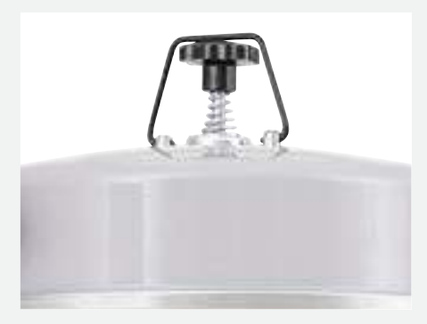
Manual filter shaker