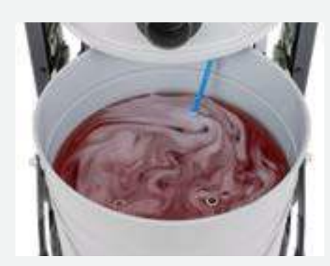
Liquid cut-off on model T40