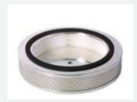
HEPA absolute filter on model T40W