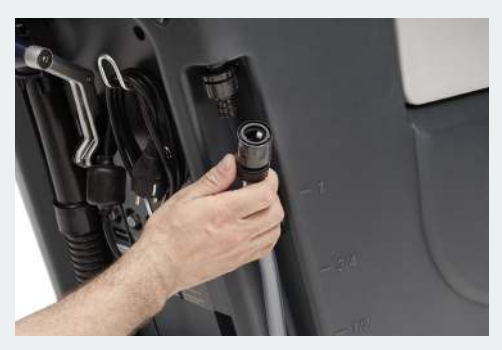
Solution hose is easy to disconnect and the solution tank can quickly be filled with water

SC530 comes in two versions: Non-traction and traction. The traction version grants easier maneuverability and allows effortless driving control for the operator.