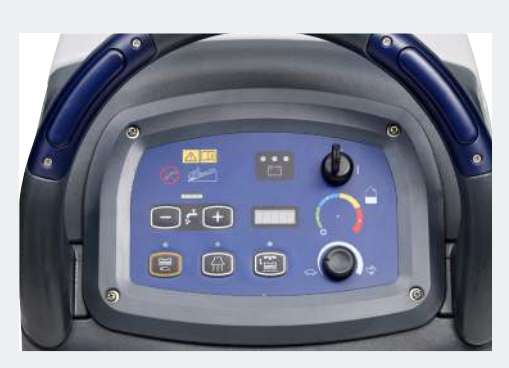
Solution flow regulation can be change from the driving position according to the floor type and level of dirt