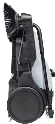
The hopper remains in place even when the sweeper is stored in an upright position or hung on the wall