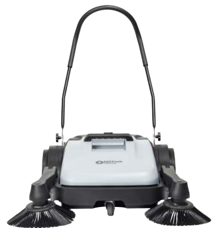
SW200 with one side broom – and SW250 with two side brooms – cover working widths of 70 cm and 90 cm.