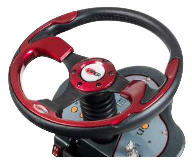
Intuitive dashboard, one touch button and user friendly menu for operation settings