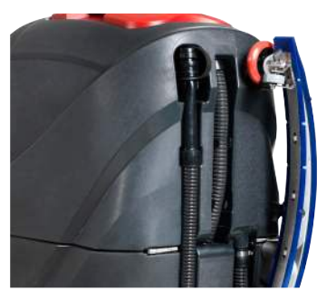
Built in squeegee hanging system for easy transport in narrow areas