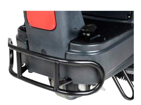
Front bumper protects the machine