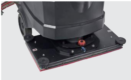
Orbital scrubber for floor cleaning or coat stripping (AS7190TO)