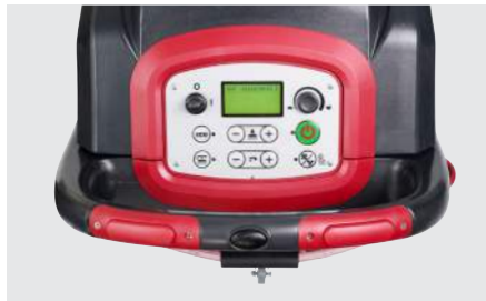
Intuitive control panel with LCD screen for all models (AS6690T/AS7690T pictured)