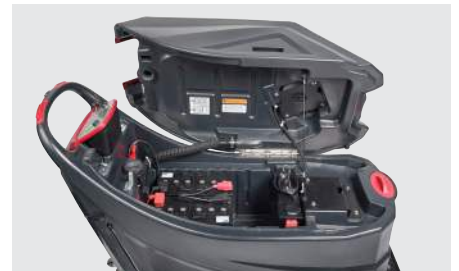
Recovery tank with hand grip for easy tilting