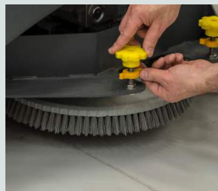
Serviceability: New maintenance free motor, high-quality gearbox and added yellow touch points