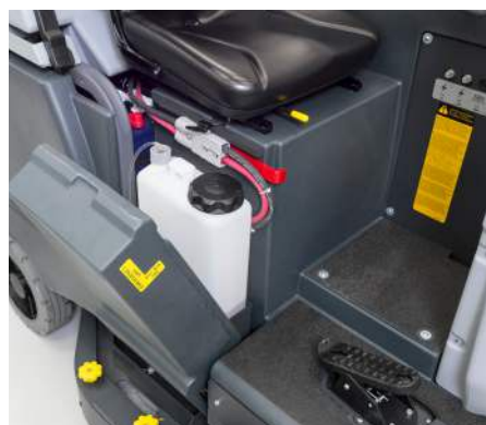
Ecoflex chemical kit (optional): easy accessible detergent cartridges