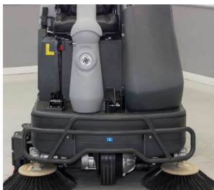
Dual side brooms (cylindrical models) deliver true edge cleaning

The exceptional Ecoflex system allows the operator to match the floor cleaning machine's performance to the soil on the floor and the required level of clean. When encountering more soiled areas of the floor, the operator can activate the "burst of power" button for extra cleaning performance, and as easily return to original settings for minimum usage of water, detergent and power. Green meets clean.