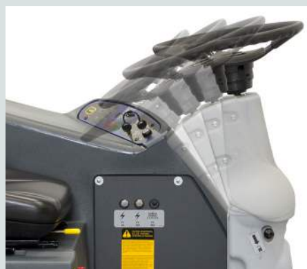
Tilt steering wheel for easy boarding, plus ergonomically designed operator compartment for safety and comfort