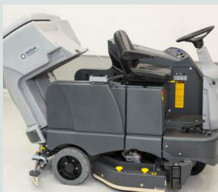
Tip-out and lift-off recovery tank