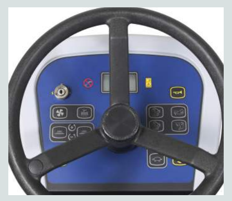
Control panel with icon buttons and modern display to reach best in class ease of use