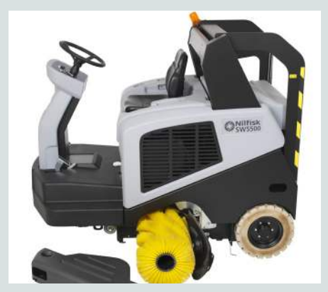
Fast and easy replacement of main components to make it easy daily operations and reduce downtime