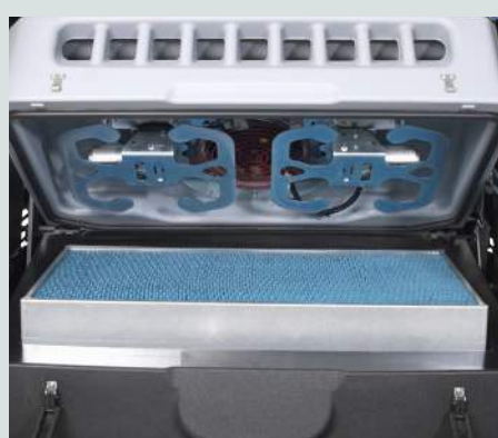
Multi-frequency timed filter shaker cleans efficiently the filter