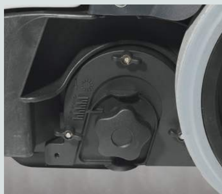
The main and side brushes are adjustable to ensure perfect pressure on the floor at all times and in all conditions.