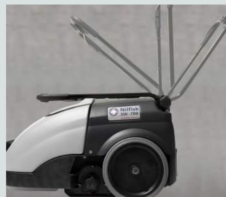
The handle is fully adjustable to suit each individual operator. It folds down completely to simplify storage.