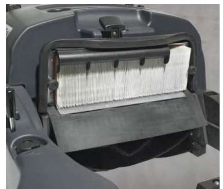
Thanks to the polyester filter the SW 750 can be used in both dry and humid areas.