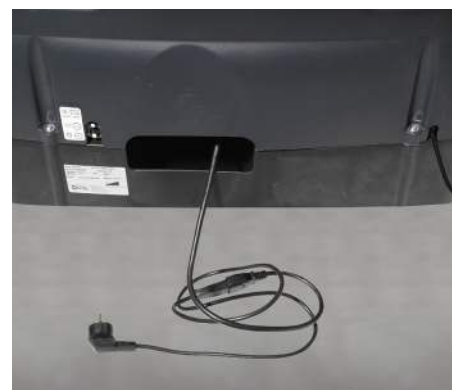
The plug-in onboard battery charger ensures continuous and hassle-free operation.