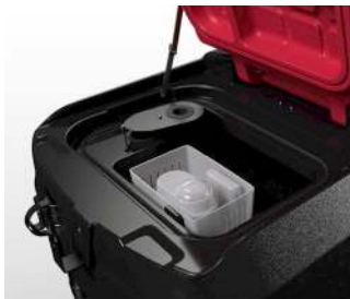
Easy-access debris tray