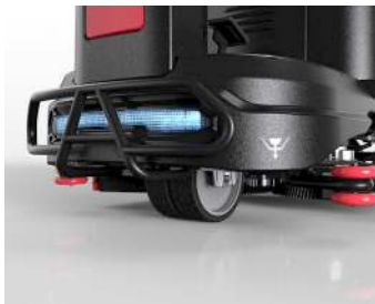
Sturdy bumper with high-visibility lights