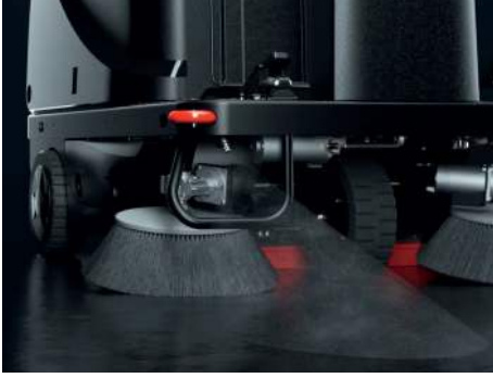
Keeps the dust down Control and containment of dust with the wet misting system insures superior results

Nilfisk, Inc. 9435 Winnetka Avenue North Brooklyn Park, MN 55445 www.nilfisk.us Phone 800-989-2235 Fax 800-989-6566 L3522V_0422