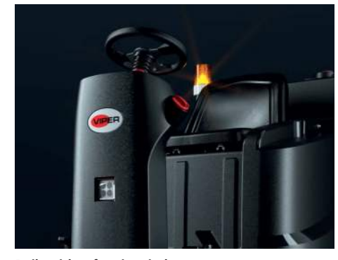
Built with safety in mind Help reduce employee and property risks with the safety-minded design